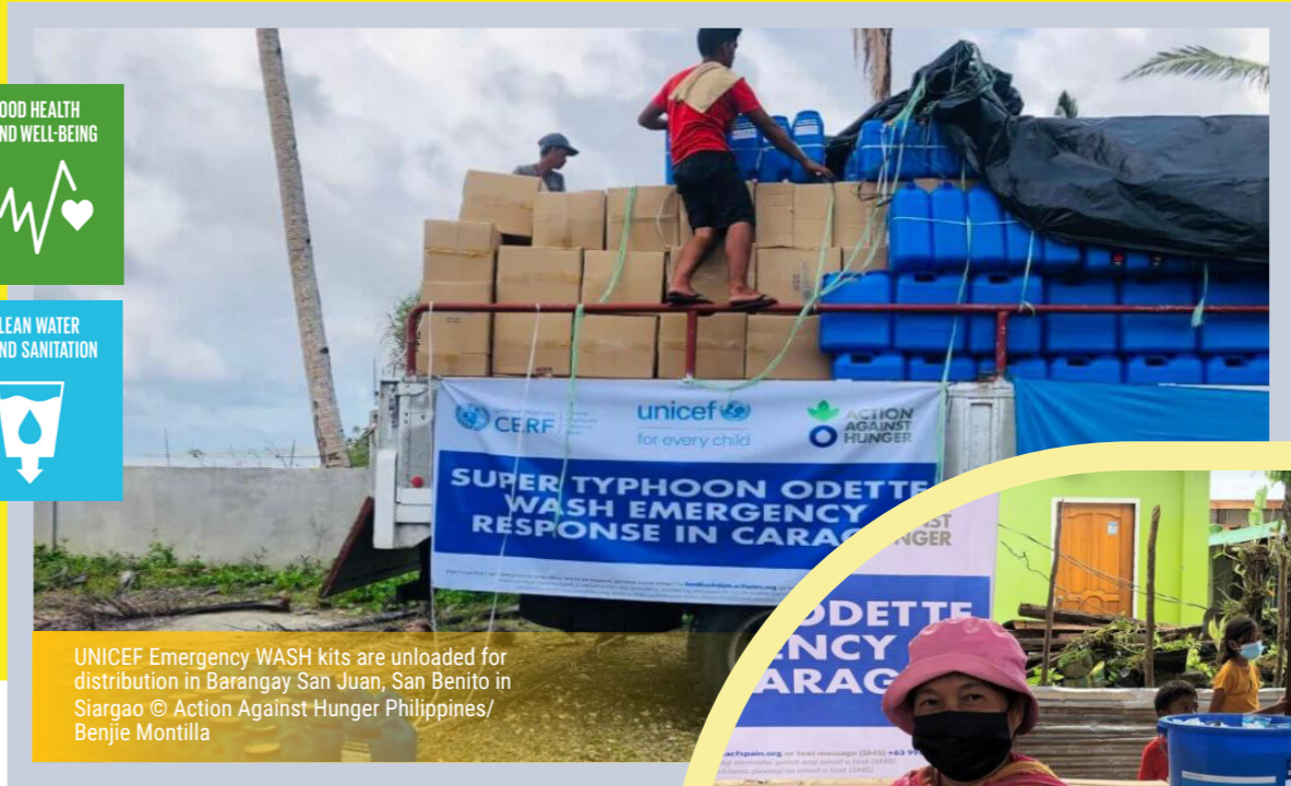
UNICEF Emergency WASH kits are unloaded for distribution in Barangay San Juan, San Benito in Siargao