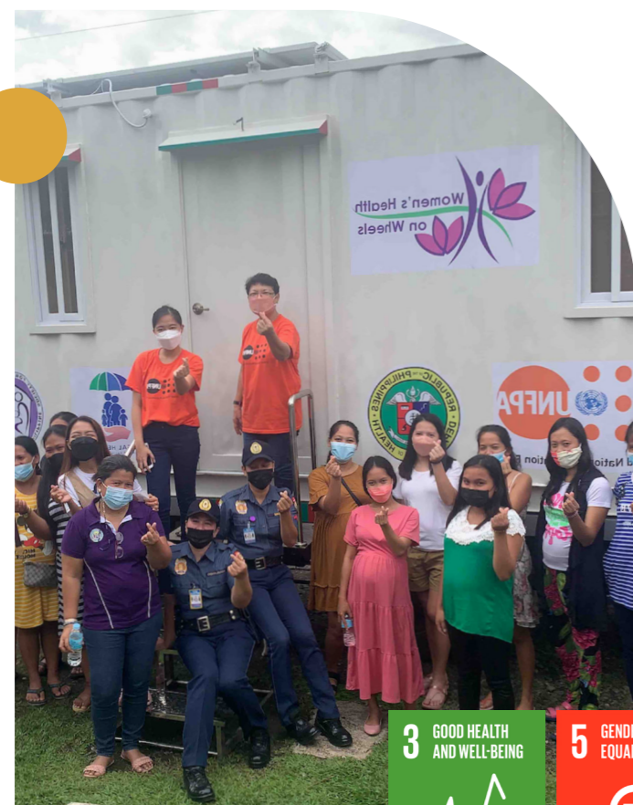
The Women's Health on Wheels facility in Saint Bernard in Typhoon Rai/Odette-affected Southern Leyte was stationed next to a school compound being used as an evacuation camp.