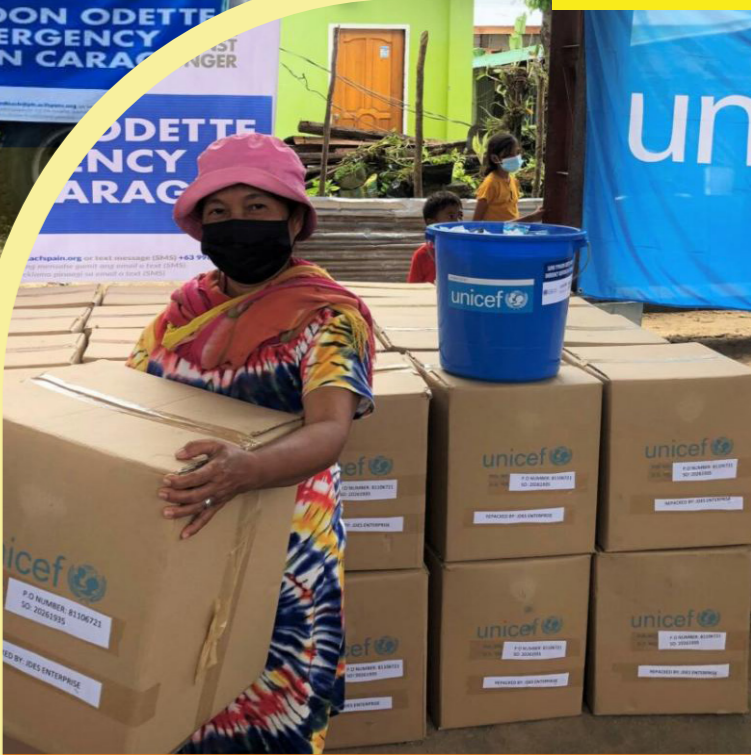
UNICEF Emergency WASH kits are unloaded for distribution in Barangay San Juan, San Benito in Siargao

Life-saving WASH assistance in the form of hygiene and/or water kits (jerry cans with Aquatabs/Hypsolol) were provided to prioritized families with children under five years old, family members with vulnerable circumstances— pregnant/lactating women (PLW); single-headed households, child-headed households; persons with disabilities (PWDs); senior citizens;