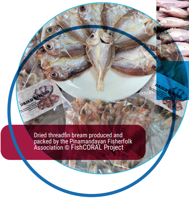
Dried threadfin bream produced and packed by the Pinamandayan Fisherfolk Association