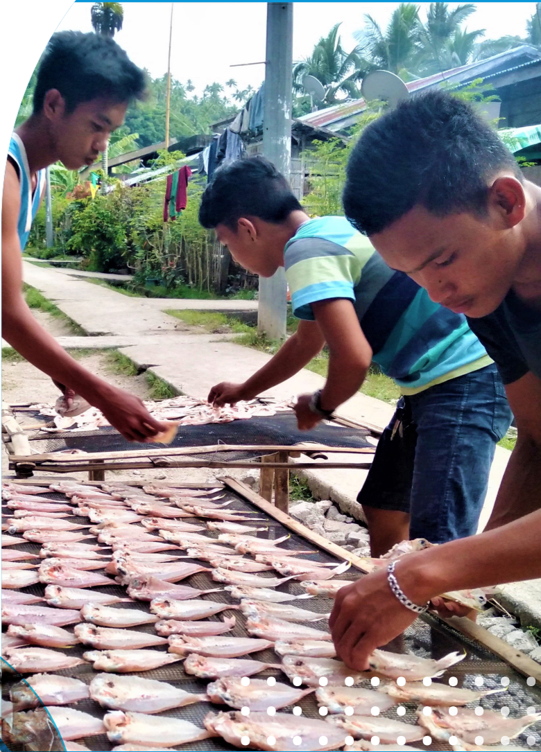
San Pascual, Masbate. Youth members of Pinamandayan Fisherfolk Association actively participate in the fish drying livelihood of their organization.