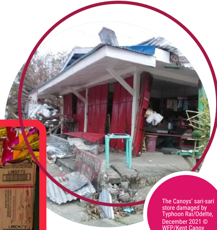
The Canoy's sari-sari store damaged by Typhoon Rai/Odette, December 2021