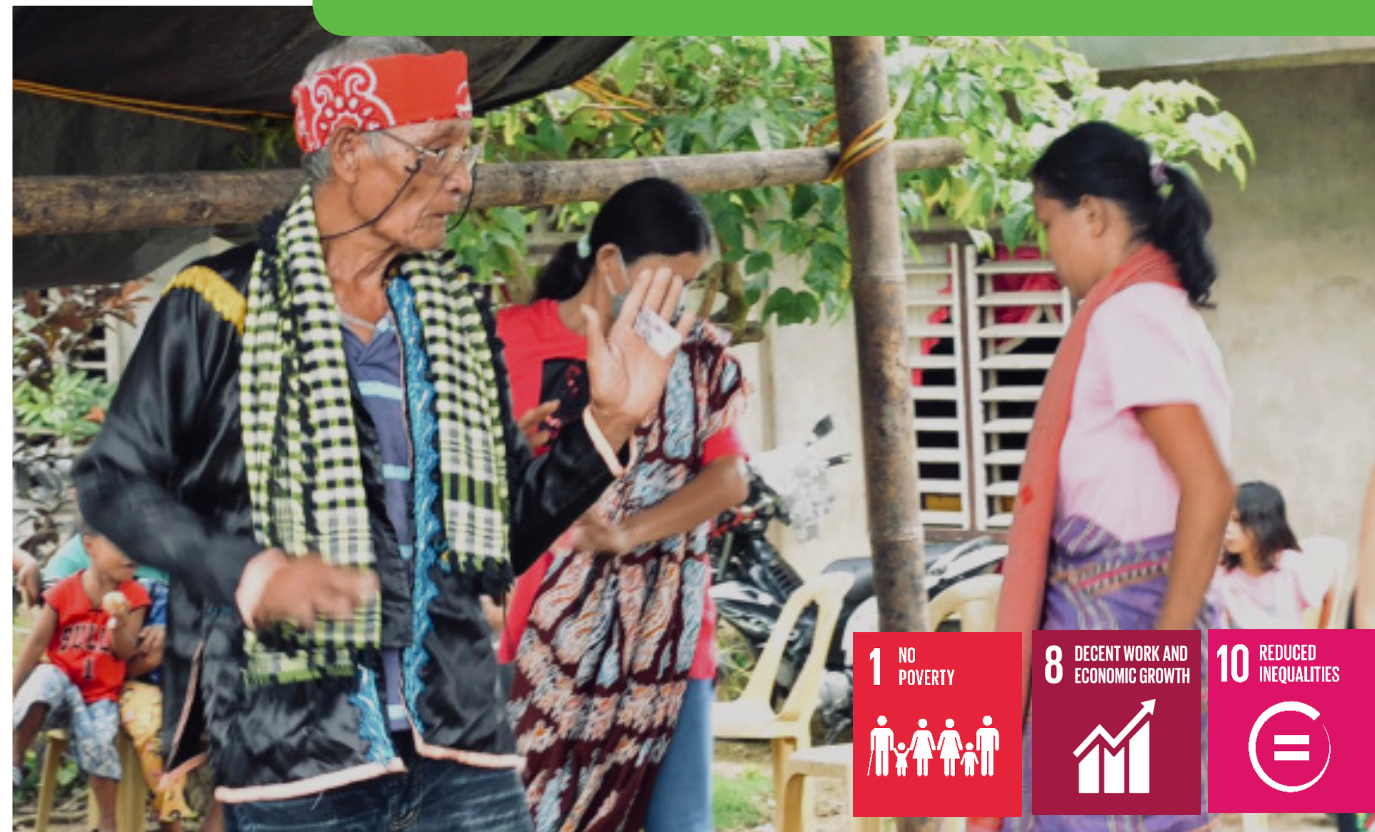
Members of the Subanen indigenous community in Titay performing a traditional dance