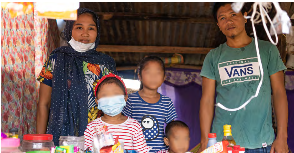
The Abdulgani family has been living in a makeshift house since the conflict between the Bangsamoro Islamic Freedom Fighters and the government broke out.

The three interlinked CF outcomes – in the areas of human capital development, inclusion and resilience building, human rights, rule of law, gender equality and peace; low-carbon economic development and decent work; and equitable climate-resilient development, natural resource management and disaster risk reduction – specifically target population groups left or at risk of being left behind, as identified in this Policy Note.